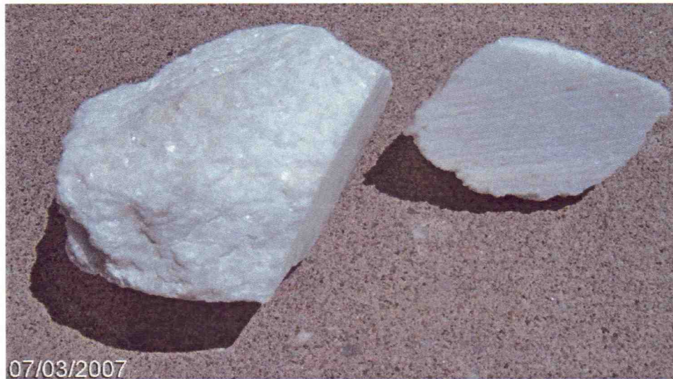
Figure 1: Photo of the test sample. The measured surface is the flat surface on the smaller piece.